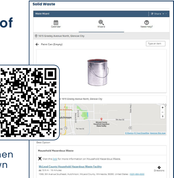
The new ReCollect recycling wizard for McLeod County will tell you when, where and how to properly dispose of your household waste. Scan the QR code to visit the website.

There are two ways to use ReCollect. You can