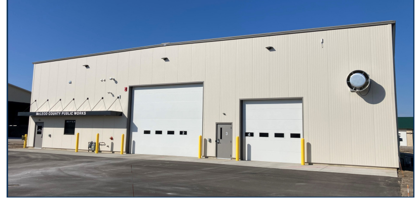
The Glencoe Area Transportation Services (GATS) facility is one of the many projects supported with funds McLeod County received from the American Rescue Plan Act.

Message Rescue work <u>ADMINISTRATOR</u> beila Murphy