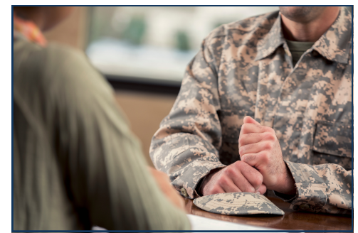
Veterans should learn how to take advantage of new state benefits in Minnesota.

Beginning on January 1, 2024, Veterans who are rated 100% permanent and total (P&T) are exempt from vehicle registration fees, vehicle title fees, and driver's license and ID fees. They must show the DMV proof of their P&T service-connected disability to receive these benefits. Additionally, effective July 1, 2024, these same P&T Veterans will be exempt from motor vehicle sales taxes.